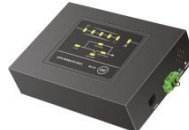
Remote Panel For 6/10kVA P/RT and T Datasheet: Link Item No.: 10120570