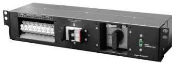
MBS 6/10kVA (Maintenance Bypass Switch) Datasheet: Item No.: 10120584