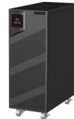
Battery Pack with 2x Battery Sets inside (Each battery set contain 20x 12V/9Ah batteries) Datasheet: Link Item No.: